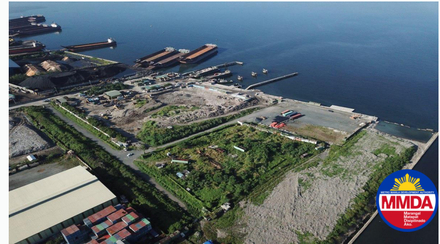
Vitas Marine Loading Station (VMLS)