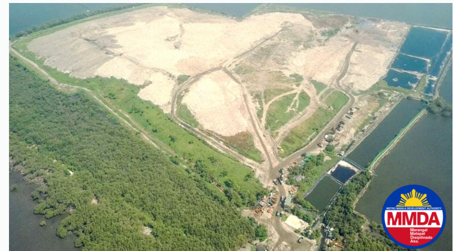
Navotas Sanitary Landfill Facility (NSLF)